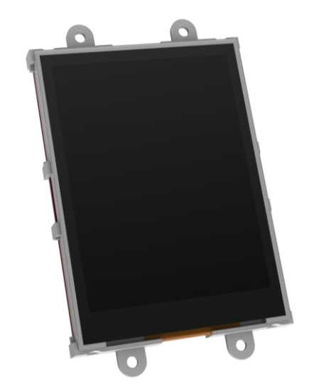
The uLCD-28-PTU Display Module