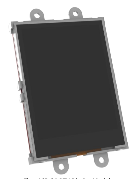
The uLCD-24-PTU Display Module