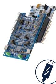
P-NUCLEO-USB001 / USB002