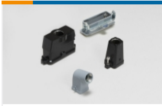
Rectangular Connector Hoods & Bases (1258)