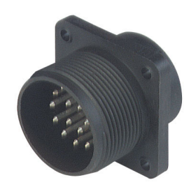
CM 02 E 20-29 P

Industrial Connectors:Circular connector CM-series:Surface mounted connector