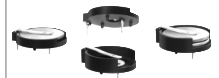
SINGLE CELL HOLDER (3-VOLT)