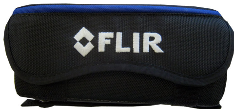
Camera Carrying Pouch