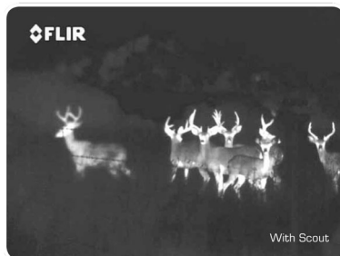
Scout PS-Series Camera Image