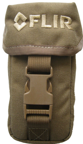
Molle-Compatible Belt Holster