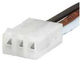
Wire Harness Wire harness for SCHURTER products