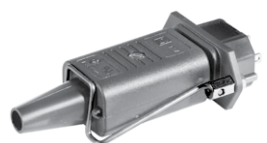
Cord retaining kits Cord retaining strain relief