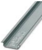
DIN rail 35 mm (NS 35)

DIN rail - NS 35/ 7,5 WH UNPERF 2000MM - 1204122