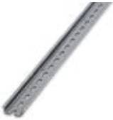
DIN rail 35 mm (NS 35)

DIN rail perforated - NS 35/ 7,5 WH PERF 2000MM - 1204119