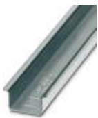
DIN rail 35 mm (NS 35)

DIN rail - NS 35/15 WH UNPERF 2000MM - 1204135