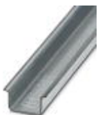
DIN rail, material: Galvanized, unperforated, height 15 mm, width 35 mm, length: 2 m

DIN rail, unperforated - NS 35/15 ZN UNPERF 2000MM - 1206586