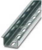
DIN rail 35 mm (NS 35)

DIN rail perforated - NS 35/15 WH PERF 2000MM - 0806602