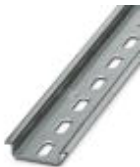
DIN rail, material: Galvanized, perforated, height 7.5 mm, width 35 mm, length: 2 m

DIN rail perforated - NS 35/ 7,5 ZN PERF 2000MM - 1206421