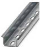
DIN rail, material: Galvanized, perforated, height 15 mm, width 35 mm, length: 2 m

DIN rail perforated - NS 35/15 ZN PERF 2000MM - 1206599