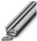
DIN rail, deep drawn, high profile, unperforated, 1.5 mm thick, material: aluminum, height 15 mm, width 35 mm, length 2000 mm

DIN rail, unperforated - NS 35/15 AL UNPERF 2000MM - 1201756