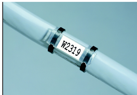
PM-sleeve with a label from a PF-sheet