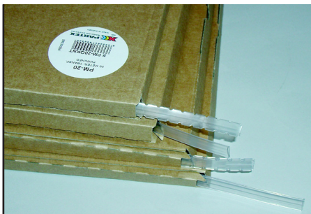
Continuous PM profiles in flat "pizza" cartons