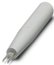
Contact removal tool

https://www.phoenixcontact.com/sk/products/3190441