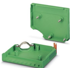
Cable housing, product range: KGS-PC 4

Please be informed that the data shown in this PDF document is generated from our online catalog. Please find the complete data in the user documentation. Our general terms of use for downloads are valid.