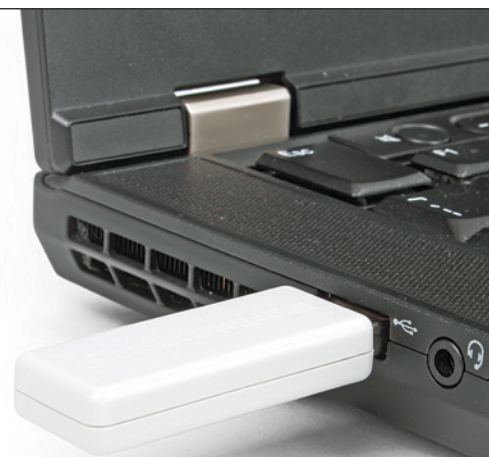
Figure 1-3: USB Dongle plugged into Laptop USB host connector

Unfortunately not. If you loose your dongle you will need to buy a new compiler license and pay the full price.