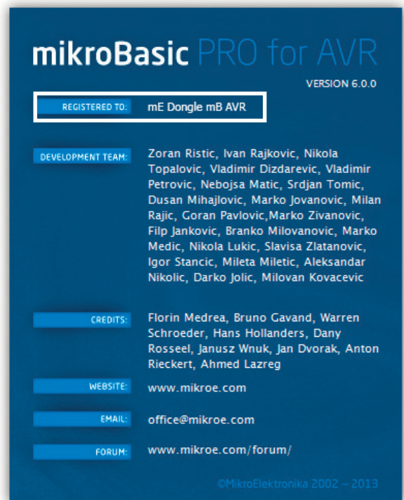
Figure 1-2: mikroBasic PRO for AVR® About Window