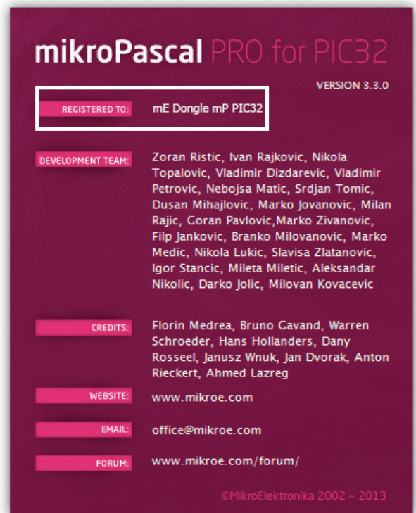
Figure 1-2: mikroPascal PRO for PIC32® About Window