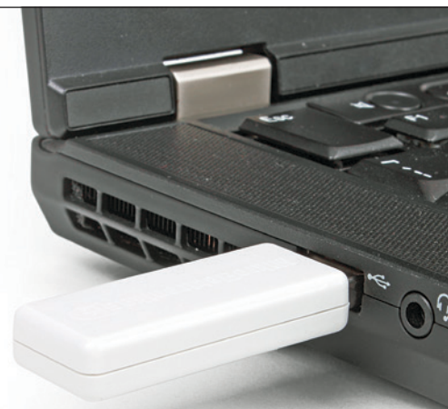
Figure 1-3: USB Dongle plugged into Laptop USB host connector

Unfortunately not. If you loose your dongle you will need to buy a new compiler license and pay the full price.