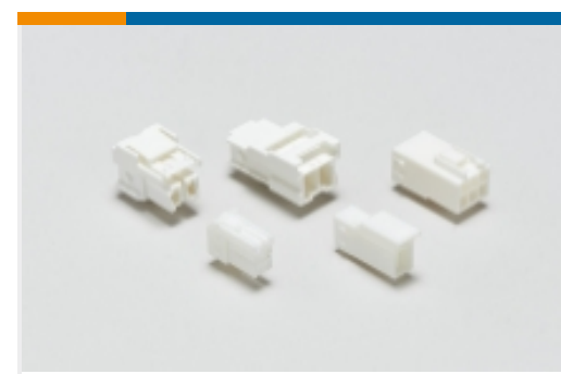
Rectangular Power Connectors(712)