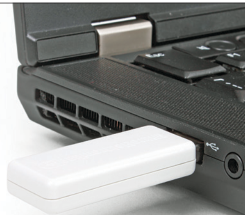
Figure 1-3: USB Dongle plugged into Laptop USB host connector

Unfortunately not. If you loose your dongle you will need to buy a new compiler license and pay the full price.