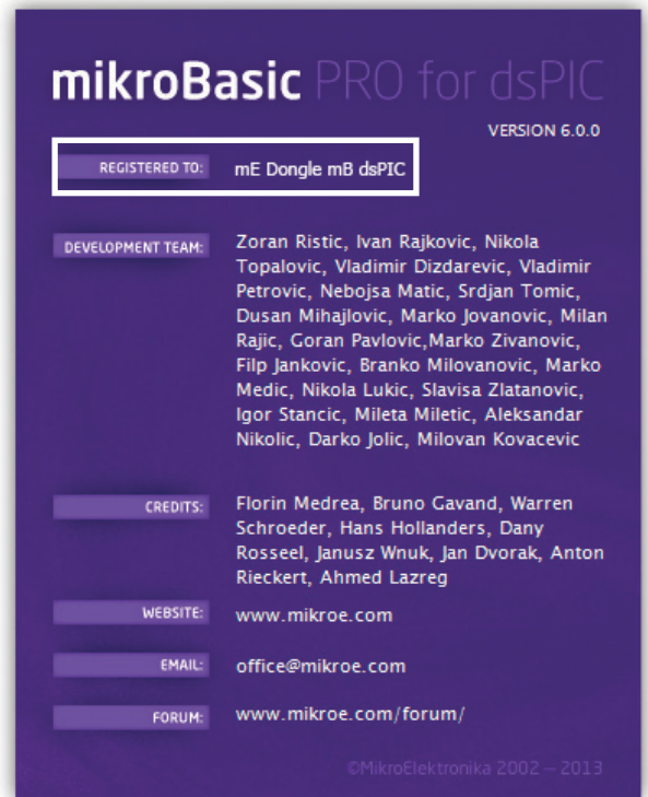
Figure 1-2: mikroBasic PRO for dsPIC® About Window