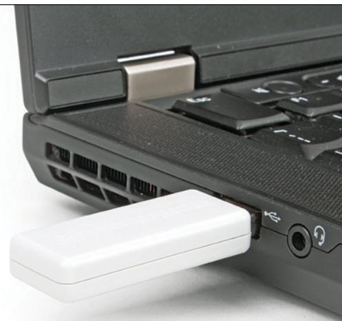
Figure 1-3: USB Dongle plugged into Laptop USB host connector

Unfortunately not. If you loose your dongle you will need to buy a new compiler license and pay the full price.