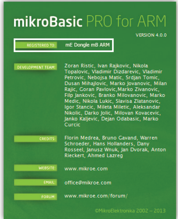
Figure 1-2: mikroBasic PRO for ARM® About Window