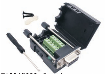
T1904C089 - Female connector with locking screw connection