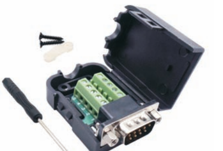
T1904C090 - Male connector with jackscrew nut connection