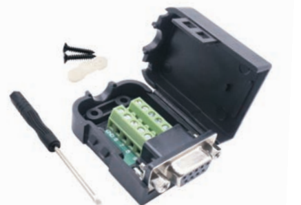
T1904C091 - Female connector with jackscrew nut connection

Included accessories 1x Screw driver 1x Cable strain Relief 2x Fastening screw