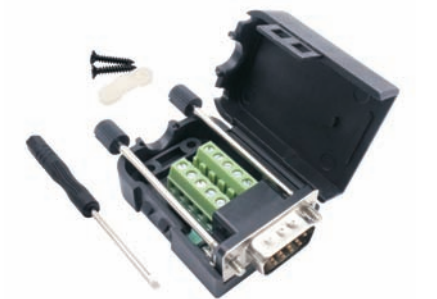
T1904C088 - Male connector with locking screw connection