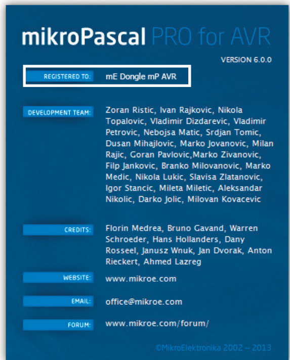
Figure 1-2: mikroPascal PRO for AVR® About Window