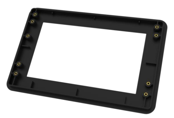
Bare 4.3" Bezel - Back