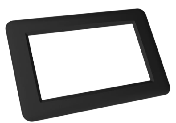
Bare 4.3" Bezel - Front