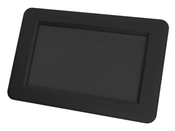
4DLCD-FT843 Mounted in 4.3" Bezel - Front