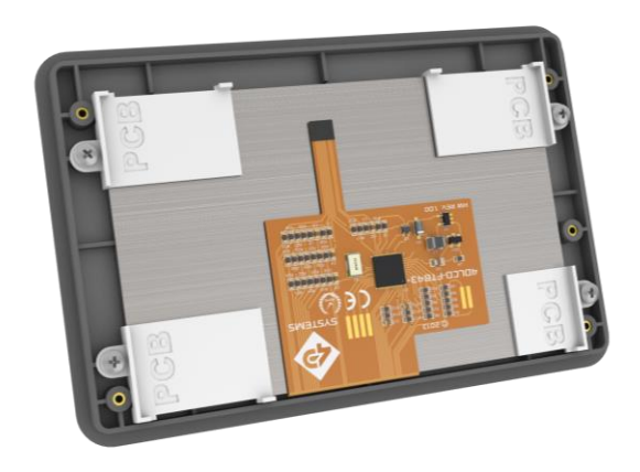
4DLCD-FT843 Mounted in 4.3" Bezel - Back