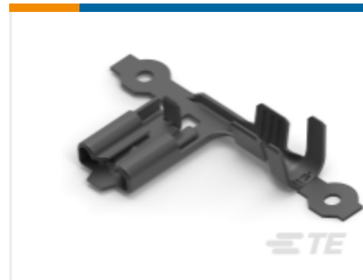
TE Part #2299293-2 POD-LOK 187 FLAG RCPT.AWG 20-16 PTPBR