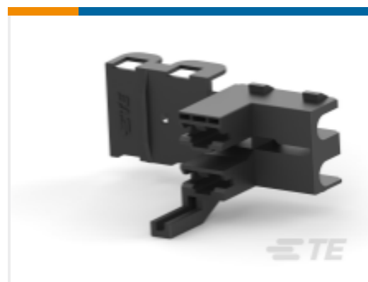
TE Part #2357275-1 POD-LOK 187 FLAG HSG. 2P NYLON BLACK