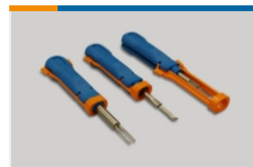
Insertion & Extraction Tools(2)