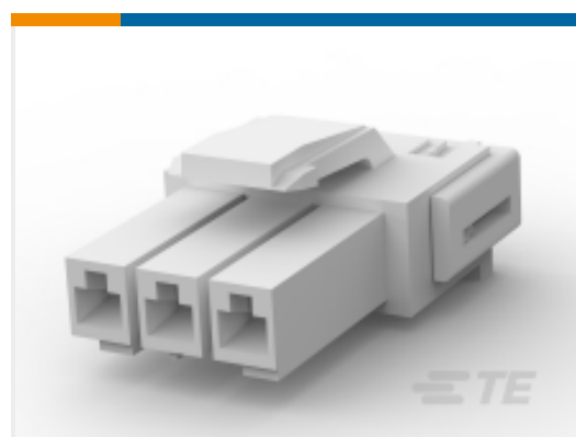
TE Part # 177899-1 POWER DBL LOCK PLUG HSG 3P