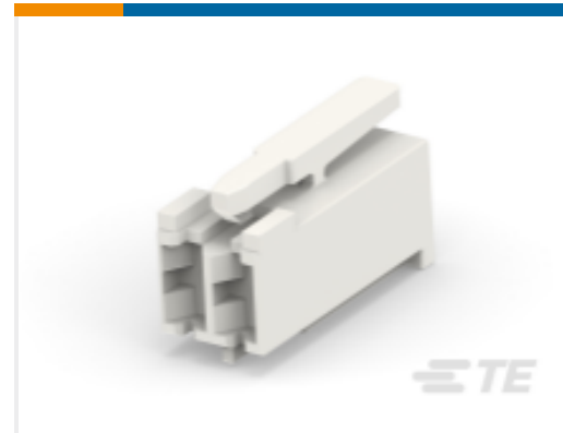
TE Part #8-1241965-2 STD TIMER PLUG HSG 2P W/EXT. LOCKING