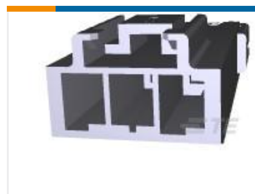
TE Part # 368572-9 PDL 3P CAP 3.96 F/H(GWT) BLK