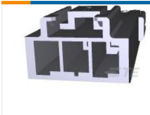
TE Part #368572-1 PDL 3P CAP 3.96 F/H(GWT) NAT