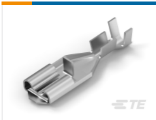
TE Part #170328-3 250 PL MKII REC. 18-14AWG PTBR