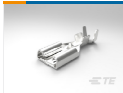
TE Part #2238135-2 RECEPTACLE, POSITIVE-LOCK, RAST 6.35