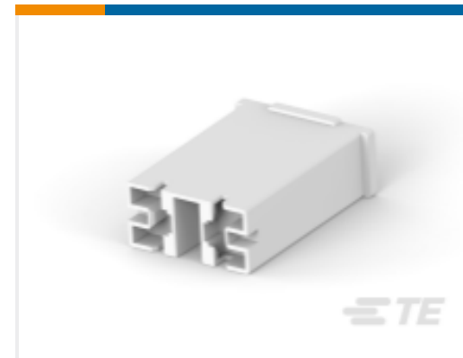
TE Part #2331087-1 250 HSG. PL MKII REC. 9mm 2P NAT