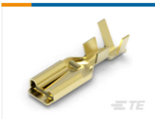
TE Part #2331225-1 187 PL EX REC. 20-14AWG PTBR