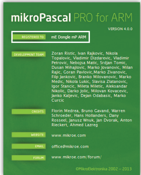
Figure 1-2: mikroPascal PRO for ARM® About Window