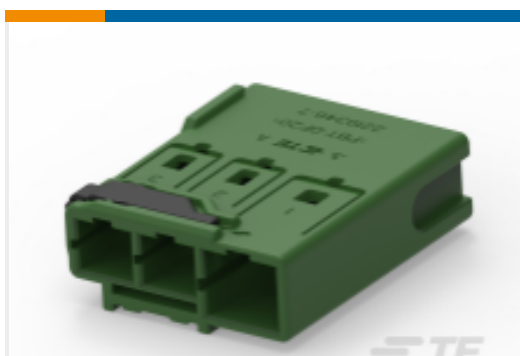
TE Part #2219346-7 RF S/L HYB 3P PLUG ASSY GRN KEYCODE A