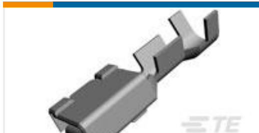
TE Part #175090-1 .187 SEALD REC CONT M