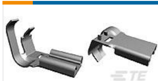
TE Part #42404-1 250 FASTON FLAG REC 18-12 AWG NPST