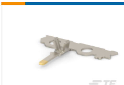
TE Part #1897799-6 TAB CONTACT FOR RF STRIPLINE