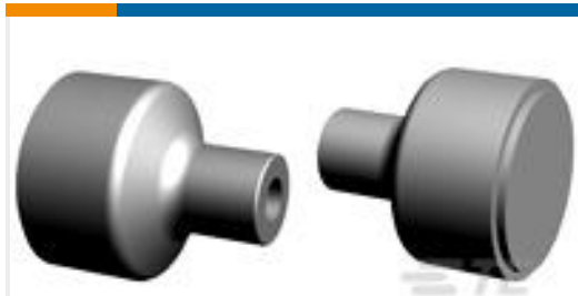
TE Part #85024-1 RUBBER PLUG GRAY FOR 187 SEALD