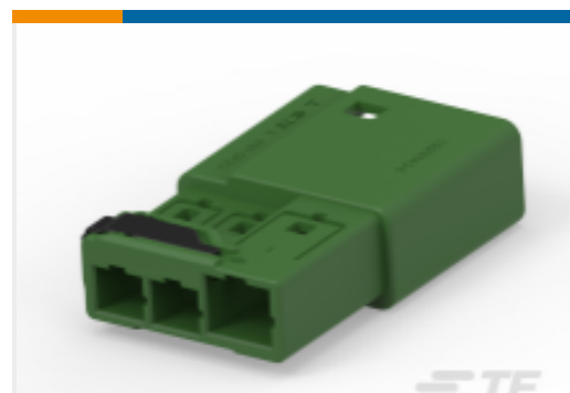
TE Part #2219343-7 RF S/L HYB 3P CAP ASSY GRN