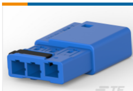
TE Part #2310556-8 RF S/L HYB 3P ALL 3PI CAP ASSY BLU