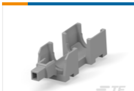
TE Part #1897795-3 RF S/L 2P REC DIELEC AR5 HSG