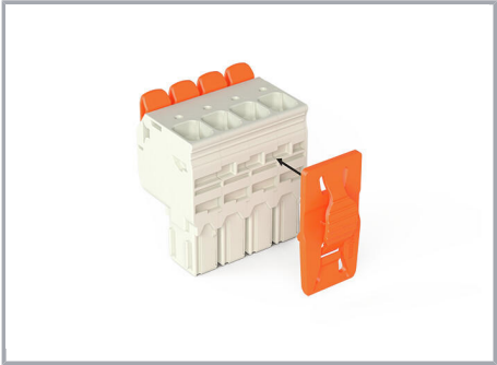
Locking lever; for field assembly