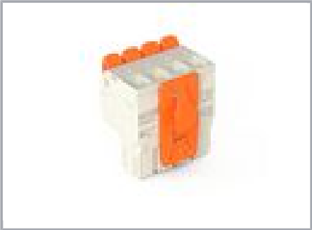
Locking lever; for field assembly

Subject to changes. Please also observe the further product documentation!