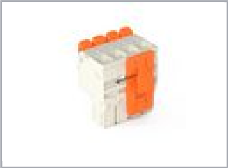
Locking lever; for field assembly