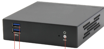
USB 3.2 Gen 1 x2