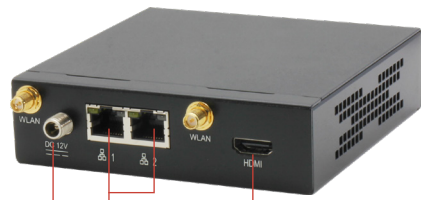
12V DC jack