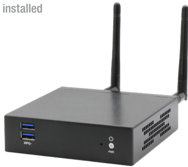
(Antennas: Optional Accessories)