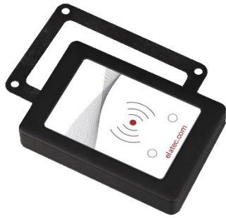
with LED holes