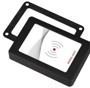
without LED holes