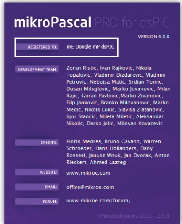
Figure 1-2: mikroPascal PRO for PIC® About Window