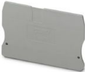
End cover, length: 71.5 mm, width: 2.2 mm, height: 49.9 mm, color: gray

Please be informed that the data shown in this PDF Document is generated from our Online Catalog. Please find the complete data in the user's documentation. Our General Terms of Use for Downloads are valid ( http://phoenixcontact.com/download )