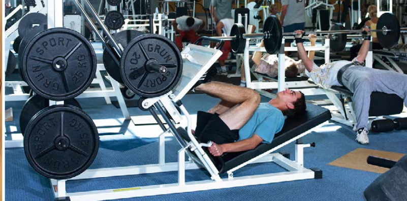
A range of applications.