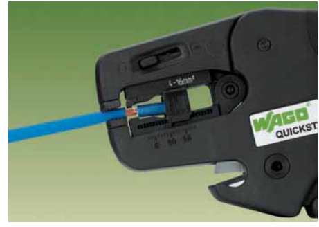
Stripping of wire.