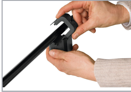
Quick and easy mounting!