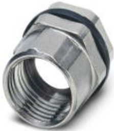
M12-SPEEDCON housing screw connection for M12 female inserts, with flat gasket, for all Speedcon-compatible THR and wave soldering contact carriers

Please be informed that the data shown in this PDF Document is generated from our Online Catalog. Please find the complete data in the user's documentation. Our General Terms of Use for Downloads are valid ( http://phoenixcontact.com/download )