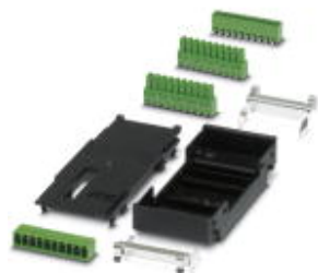
Bus connector set consisting of 2 x 10-pos. connectors, plastic upper part and base, plus metal clamp for mounting on DIN rail, without PCB

Please be informed that the data shown in this PDF Document is generated from our Online Catalog. Please find the complete data in the user's documentation. Our General Terms of Use for Downloads are valid ( http://phoenixcontact.com/download )