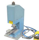
Part # 312522-1