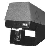
Part # 931800-1