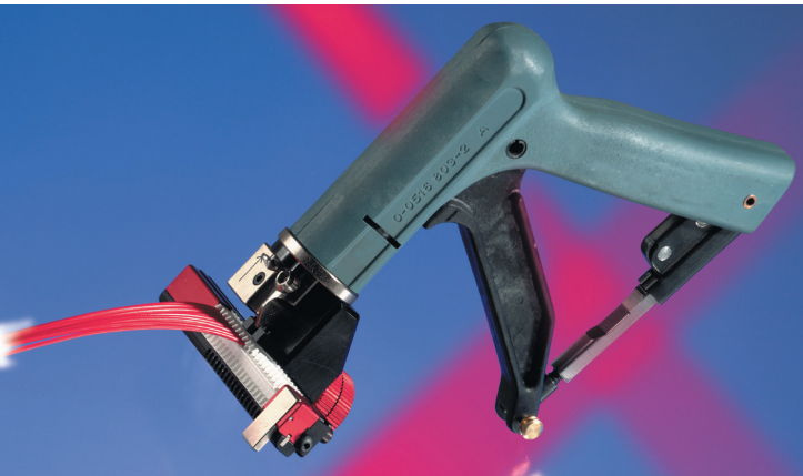
Manual Hand Tool with Interchangeable Heads