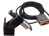
Part # 58338-1