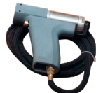
Part # 58075-1