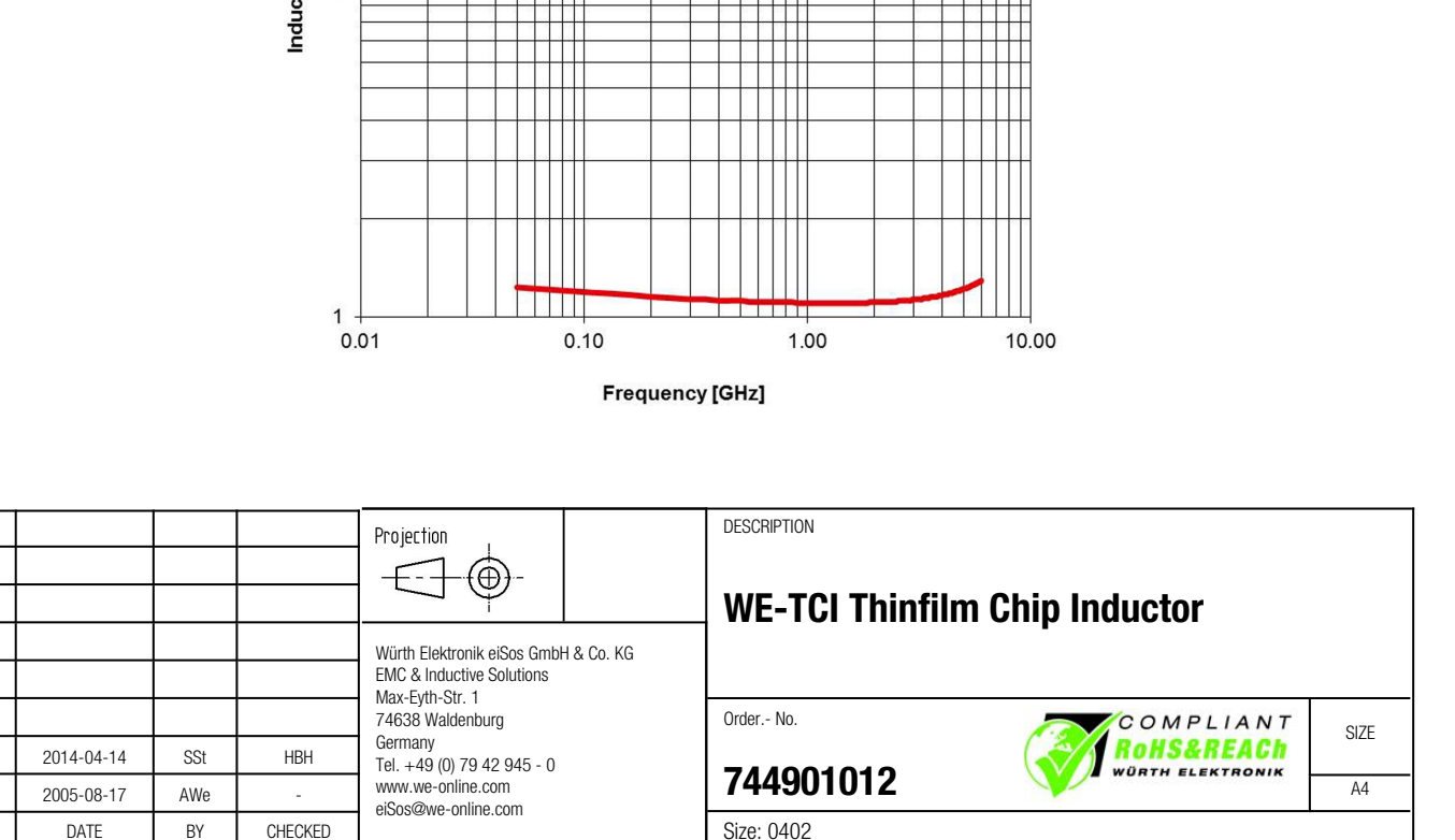
F2 Typical Inductance vs. Frequency Characteristics:

This electronic component has been designed and developed for usage in general electronic equipment only. This product is not autiborized for use in equipment where a failure of the product is reasonably expected to cause severe personal injury or death, unless the parties have executed an agreement specifically governing such use. Moreover Würth Elektronik eiSos GmbH & Co KG products are neither designed nor intended for use in areas such as military, aerospace, aviation, nuclear control, submarine, transportation signal, disaster prevention, medical, public information network etc.. Würth Elektronik eiSos GmbH & Co KG must be informed on every electronic component which is used in detrical incruits har equire half billity functions or performance.