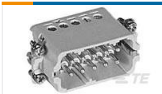
TE Part #1-1103638-1 HE.16.STI.S.B 1-16