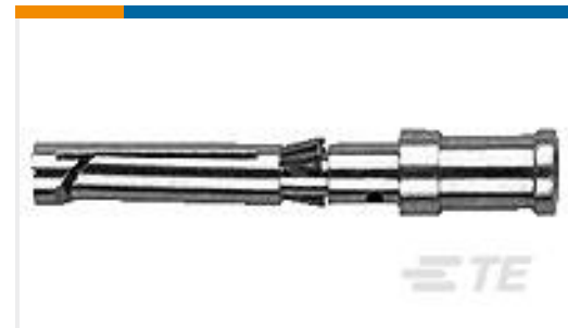
TE Part #4-1105051-1 HN.D-C-BU.AG.1,5