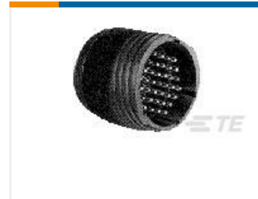
TE Part #206036-3 RECEPT,SZ 17-16,CPC