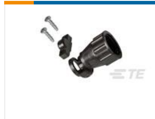
TE Part #1-206062-4 CABLE CLAMP KIT #11