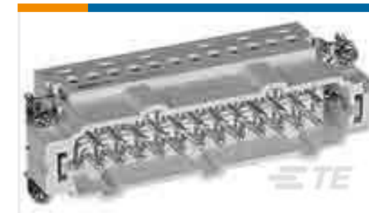
TE Part #1-1103640-1 HE.24.STI.S.1-24