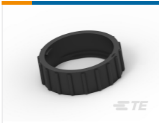
TE Part #213812-1 CPC Accessories