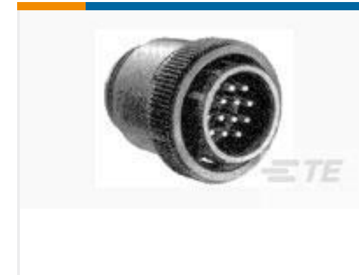
TE Part #206429-1 CPC PLUG ASSY, 11-4, REV SEX