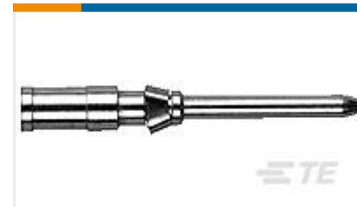
TE Part #4-1105050-1 HN.D-C-STI.AG.1,5