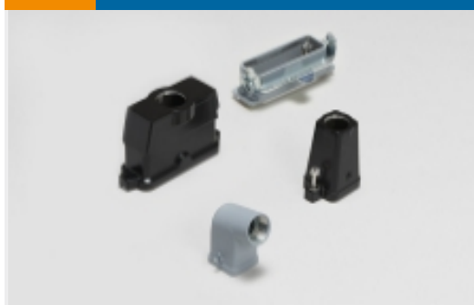
Rectangular Connector Hoods & Bases (1258)