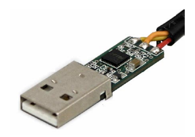
Figure 2 - Inside the USB 'A' connector on the TTL-232R-3V3.