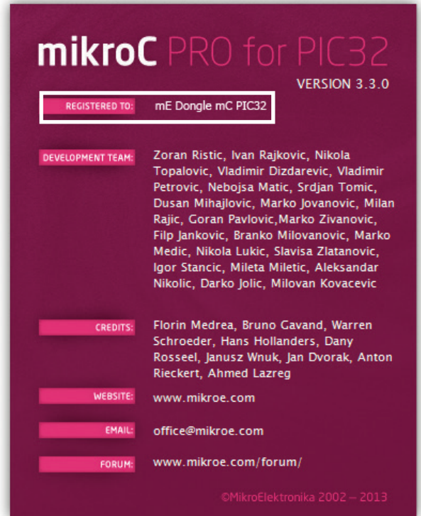
Figure 1-2: mikroC PRO for PIC32® About Window