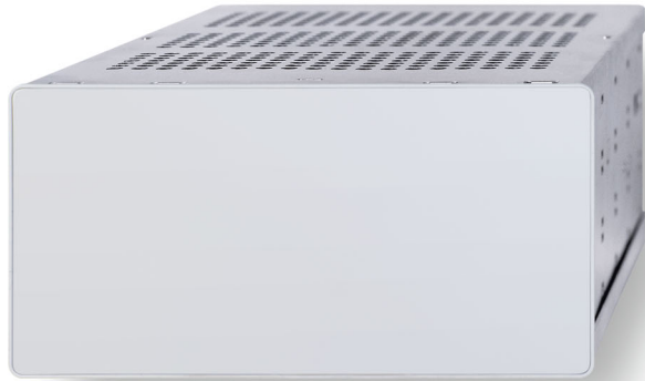
Mainframe HM8001-2 required for operation