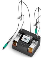
NANE 2-Tool Nano Soldering