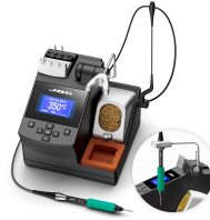
CDN High-Precision Soldering Station