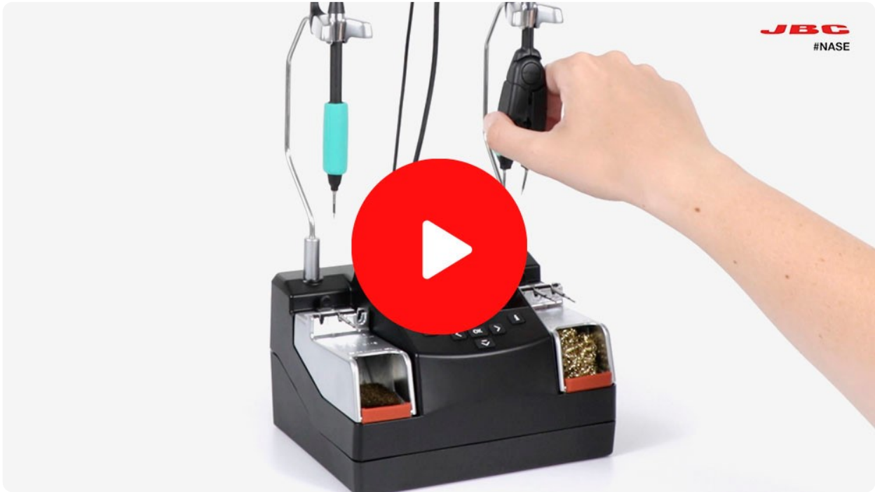
Discover NASE How it works and all its features