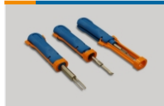
Insertion &amp; Extraction Tools(2)