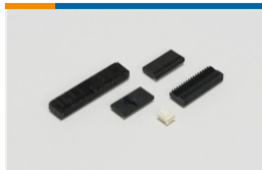
Wire-to-Board Connector Assemblies & Housings(54)