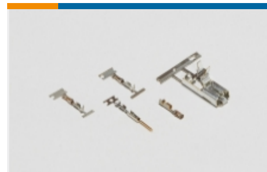
Wire-to-Board Connector Contacts(10)