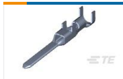
TE Part #175289-2 DYNAMIC D-3 TAB CONT. L AU 0.38 L /P