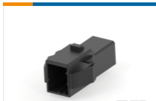
TE Part #1-1318114-4 Receptacle and Tab Housing: 2.5 mm Pitch, 250V