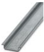
DIN rail, material: Galvanized, unperforated, height 7.5 mm, width 35 mm, length: 2 m

DIN rail, unperforated - NS 35/ 7,5 ZN UNPERF 2000MM - 1206434