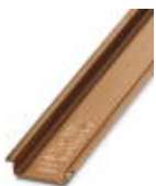
DIN rail, material: Copper, unperforated, height 7.5 mm, width 35 mm, length: 2 m

DIN rail, unperforated - NS 35/ 7,5 CU UNPERF 2000MM - 0801762