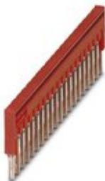
Plug-in bridge, pitch: 3.5 mm, number of positions: 20, color: red

Please be informed that the data shown in this PDF Document is generated from our Online Catalog. Please find the complete data in the user's documentation. Our General Terms of Use for Downloads are valid ( http://phoenixcontact.com/download )