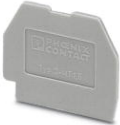
End cover, length: 22 mm, width: 1 mm, height: 17.7 mm, color: gray

Please be informed that the data shown in this PDF Document is generated from our Online Catalog. Please find the complete data in the user's documentation. Our General Terms of Use for Downloads are valid ( http://phoenixcontact.com/download )