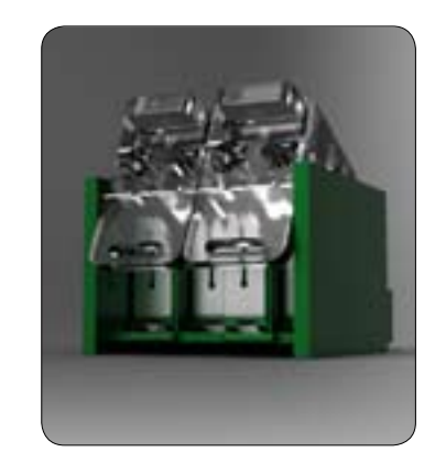
Insulation Displacement Intended for use in industrial communications and control applications such as analog or serial communications using 22-24 awg wire. Pivot block plug mates with 3.5mm horizontal and vertical terminal block headers.