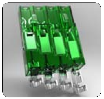
Crimp Style A terminal block plug that utilizes an insertable crimp snap contact for wire termination. This plug will mate to standard headers on 5.08mm. Intended for use in higher volume applications. Used in conjunction with junior