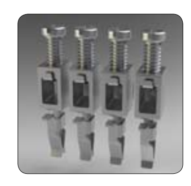
Rising Cage Intended for use in more rugged applications, such as industrial controls, data acquisition and communications products, where multiple wire terminations are required. Available in one piece and two piece configurations.