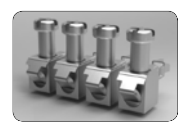
Wire Protector Version

Recommended for low cost commercial applications. Intended for use in lighter duty or commercial applications such as security and alarm systems or HVAC controls. Prevents the screw from damaging the wire!