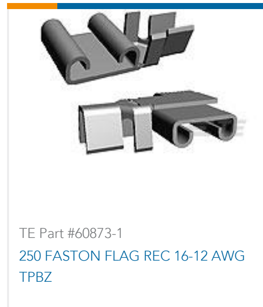
TE Part #60873-1 250 FASTON FLAG REC 16-12 AWG TPBZ