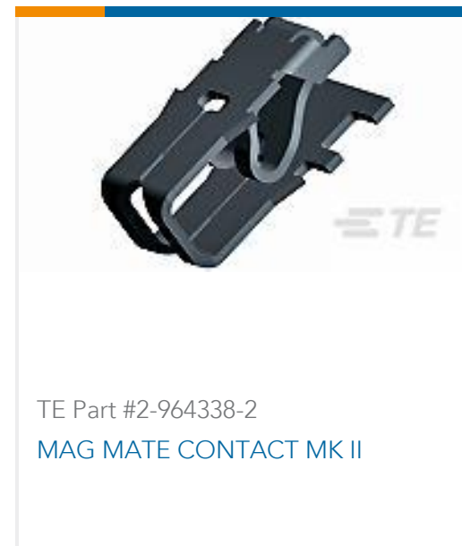
TE Part #2-964338-2 MAG MATE CONTACT MK II