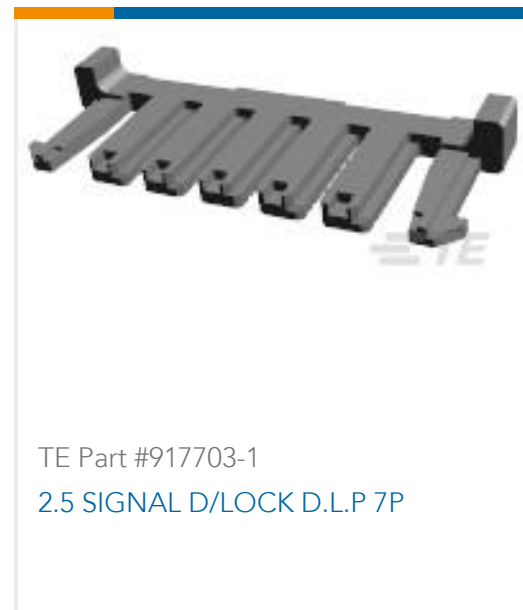
TE Part #917703-1 2.5 SIGNAL D/LOCK D.L.P 7P