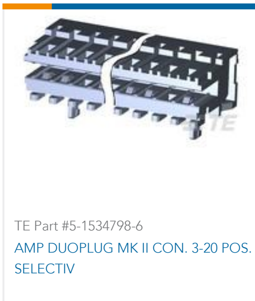
TE Part #5-1534798-6 AMP DUOPLUG MK II CON. 3-20 POS. SELECTIV