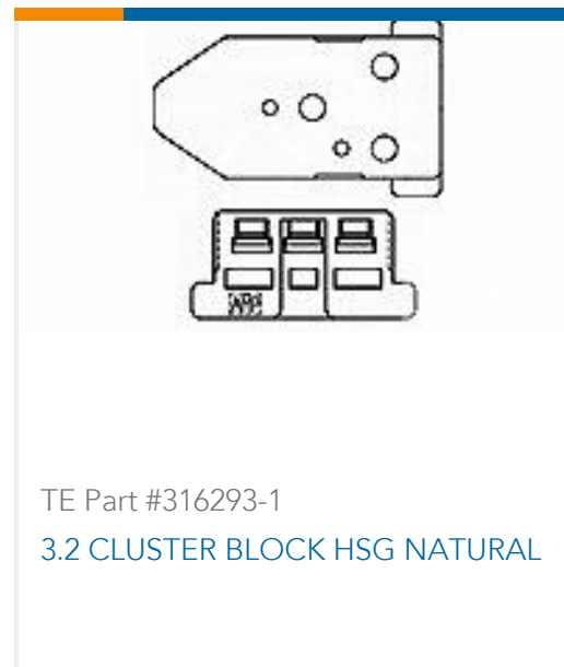
TE Part #316293-1 3.2 CLUSTER BLOCK HSG NATURAL