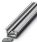
DIN rail, deep drawn, high profile, unperforated, 1.5 mm thick, material: aluminum, height 15 mm, width 35 mm, length 2000 mm

DIN rail, unperforated - NS 35/15 AL UNPERF 2000MM - 1201756