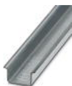
DIN rail, material: Galvanized, unperforated, height 15 mm, width 35 mm, length: 2 m

DIN rail, unperforated - NS 35/15 ZN UNPERF 2000MM - 1206586