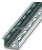
DIN rail 35 mm (NS 35)

DIN rail perforated - NS 35/15 WH PERF 2000MM - 0806602