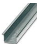
DIN rail 35 mm (NS 35)

DIN rail - NS 35/15 WH UNPERF 2000MM - 1204135