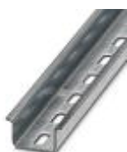
DIN rail, material: Galvanized, perforated, height 15 mm, width 35 mm, length: 2 m

DIN rail perforated - NS 35/15 ZN PERF 2000MM - 1206599