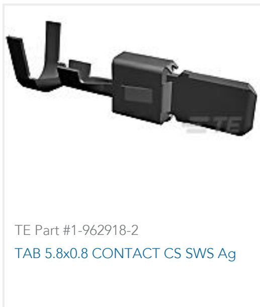
TE Part #1-962918-2 TAB 5.8x0.8 CONTACT CS SWS Ag