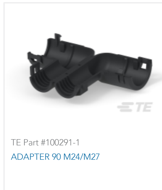
TE Part #100291-1 ADAPTER 90 M24/M27