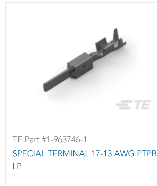
TE Part #1-963746-1 SPECIAL TERMINAL 17-13 AWG PTPB LP