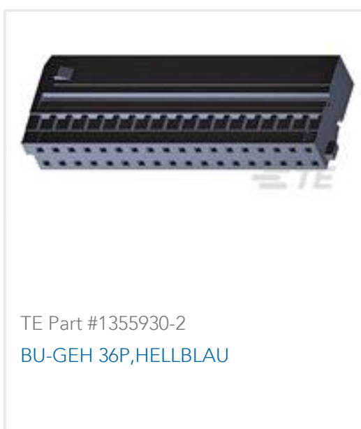
TE Part #1355930-2 BU-GEH 36P,HELLBLAU