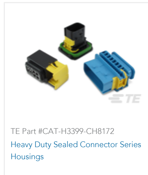
TE Part #CAT-H3399-CH8172 Heavy Duty Sealed Connector Series Housings