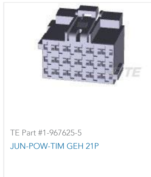
TE Part #1-967625-5 JUN-POW-TIM GEH 21P