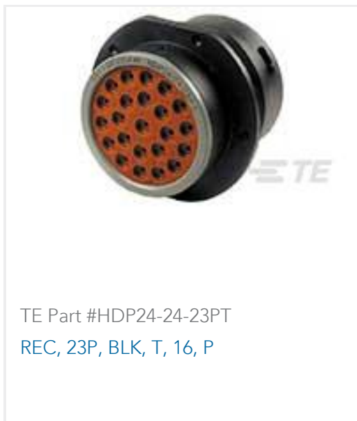
TE Part #HDP24-24-23PT REC, 23P, BLK, T, 16, P