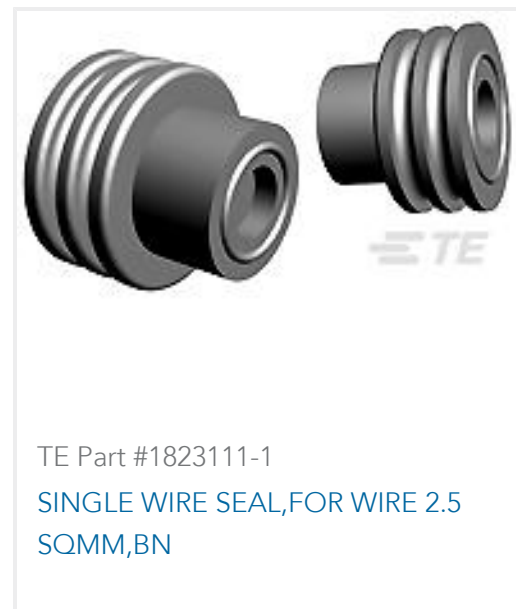
TE Part #1823111-1 SINGLE WIRE SEAL, FOR WIRE 2.5 SQMM, BN