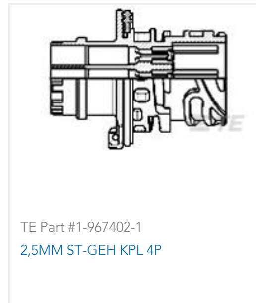
TE Part #1-967402-1 2,5MM ST-GEH KPL 4P