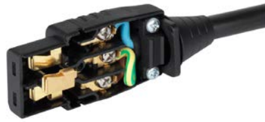
Example with assembled cable